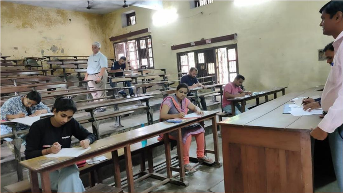
IGNOU Examination Centre – 2704, Bareilly College, Bareilly