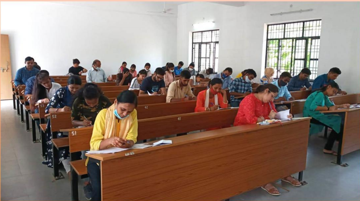
IGNOU Examination Centre – 2701, Shri Jai Narain PG College, Lucknow