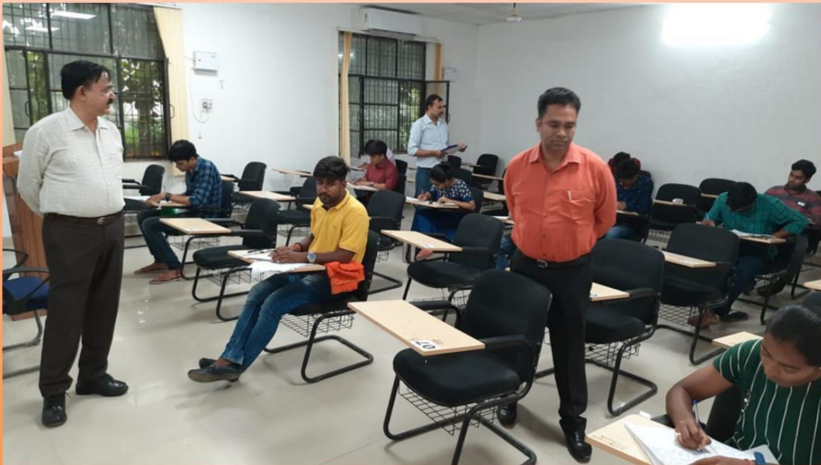
IGNOU Examination Centre – 27218, Dr. Ram Manohar Lohiya University, Ayodhya