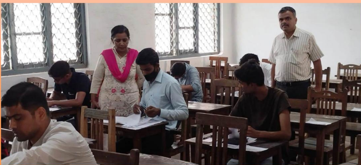
IGNOU Examination Centre – 2747, Feroze Gandhi College, Raebareli