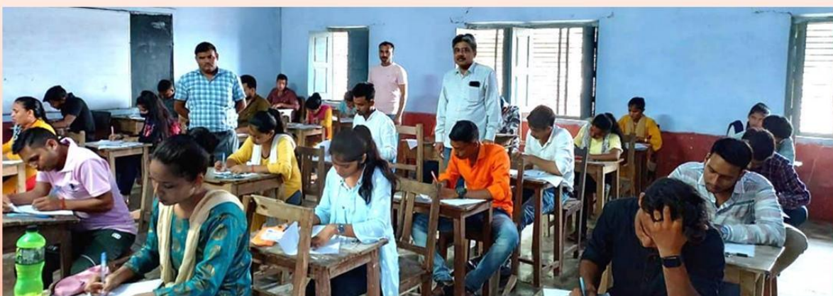
IGNOU Examination Centre – 27211, Ram Swaroop Gramodyog PG College, Pukhrayan Kanpur Dehat

Term End Examinations June-2022 are being conducted smoothly at all the examination centres under the jurisdiction of IGNOU, Regional Centre, Lucknow. All the examination centres superintendents have been instructed to follow the guidelines sent by IGNOU HQs and Regional Centre and to fill the attendance at online attendance monitoring system through the provided link on regular basis.