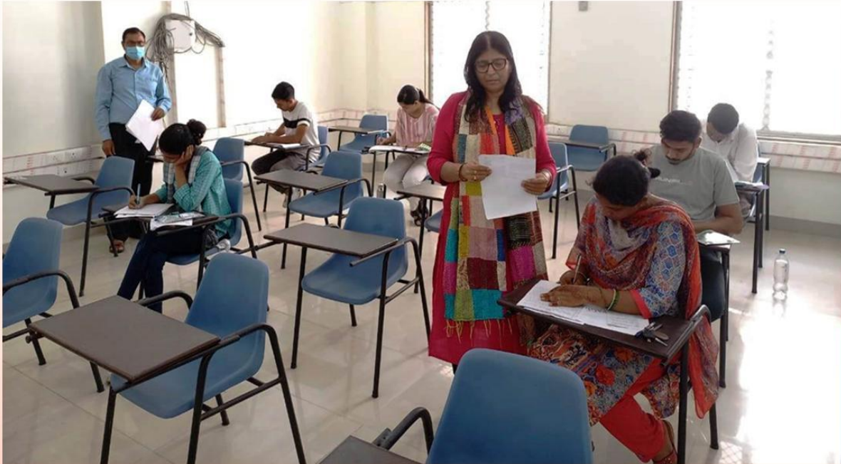
IGNOU Examination Centre – 2700, IGNOU, Regional Centre, Lucknow